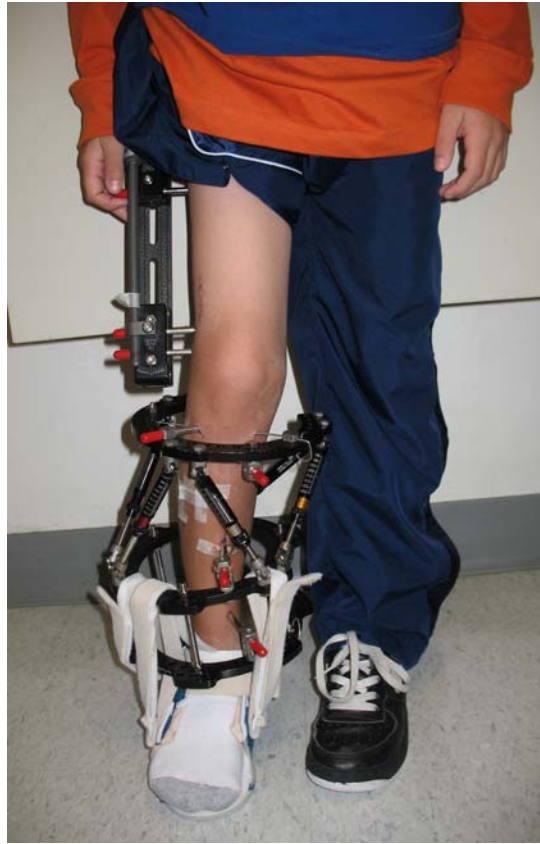
Figure 2: EBI monolateral femur frame and Taylor Spatial Tibial Frame utilized for the stage 2 procedure.