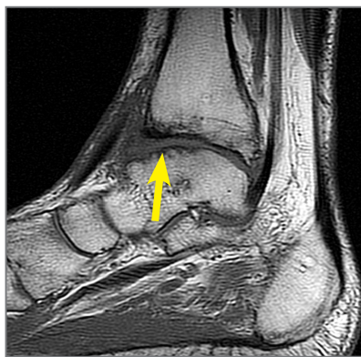
MRI done one year after distraction surgery shows great improvement