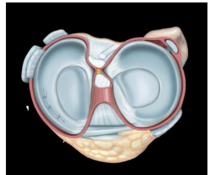
B. Meniscus repair (after surgery)