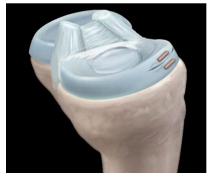
C. Meniscus repair (lateral view after surgery)